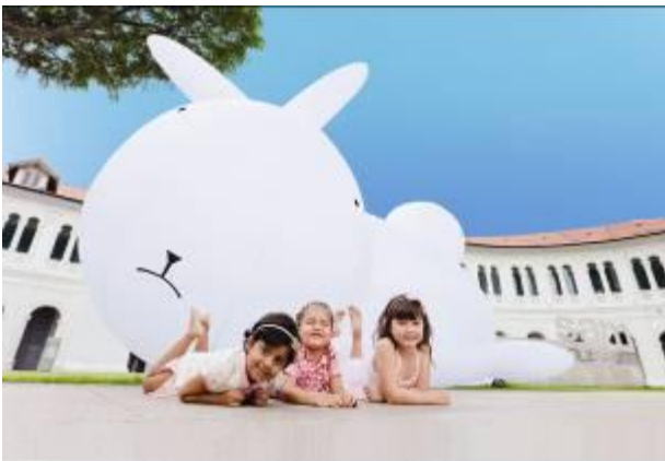
Walter by Dawn Ng

Museum admission charges apply, free for children aged 6 and below . Free admission is applicable every Friday from 6 to 9pm and on Open House days.