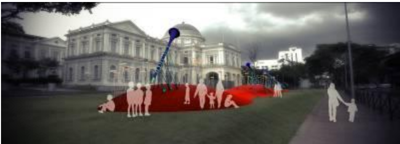
Artists' impression of Domescape © Butterpaper Designs, BusyBody and Lin ZiHao

Domescape is an interactive contemporary art installation and the visual insignia of The PlayDome: Kaleidoscope of Dreams . It is also a landscape seen through the curious eyes of children, stretching their imagination beyond the visible in the environment. By using the viewing scope as an apparatus, children are guided to see the Museum's Dome as more than a mere institutional symbol and are introduced to elements of endless possibilities.