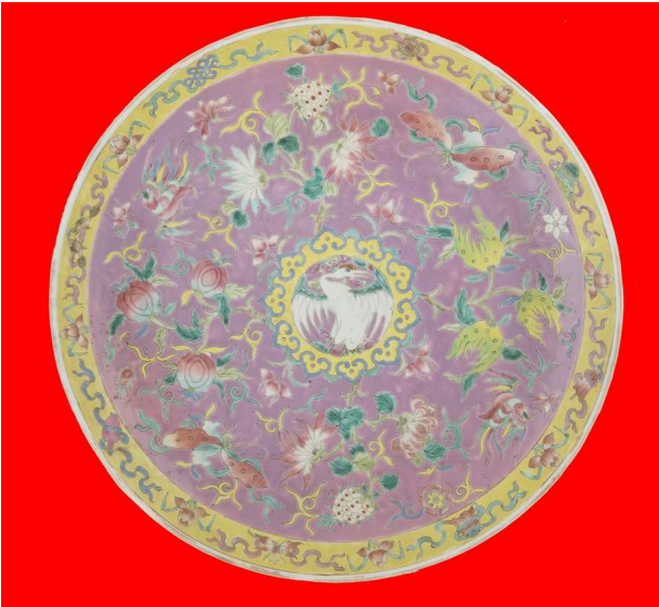
Pink ground platter with insect and fruit motifs Guangxu period (1875-1908) China

Kamcheng comes in a variety of sizes from as little as four centimetres wide to as large forty. The larger examples like this one usually served as a sort of serving tureen for use on special occasions such as birthdays or weddings. However, while Peranakan porcelain was made in China it was decorated specifically to their tastes. Bright, pastel colours and phoenix and peony motifs predominate.