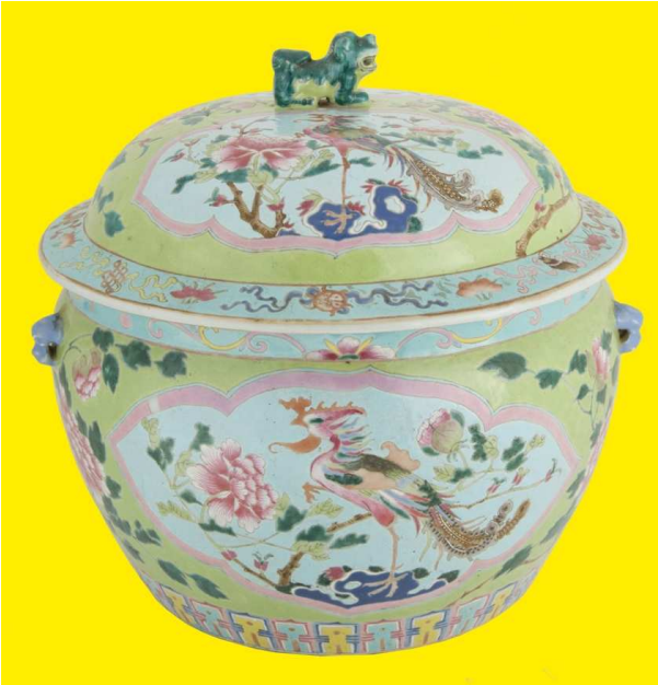
Lime green ground kamcheng with turquoise panels Early Republican period (1911-1930) China