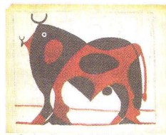
Groninger Museum (top); Colección Abello (above)