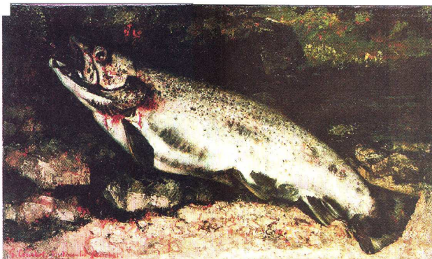
Courbet's "La Truite," right, is in an exhibition in Paris. Horse- and deer-shaped gold ornamentation for the headdress of a Scythian prince is on view in Munich. A bronze crane from the Qing dynasty is in a London show about China's first emperor.