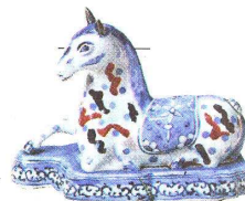
An 18th-century horse in Imari porcelain, above, is in a display of Japanese ceramics in Groningen, the Netherlands. A bull in gouache by Oscar Dominguez is part of a show of works on paper in Madrid.