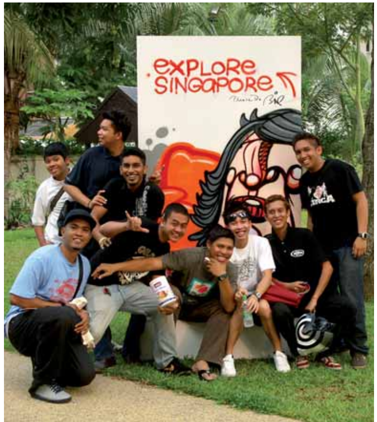
Explore Singapore! was a three-month long outreach programme led by NHB, in collaboration with Media Development Authority and National Library Board.

The tax deductible donations must only be used for activities of the members in line with their approved objectives. Members may invest donations not immediately required in such investments as permitted by law.