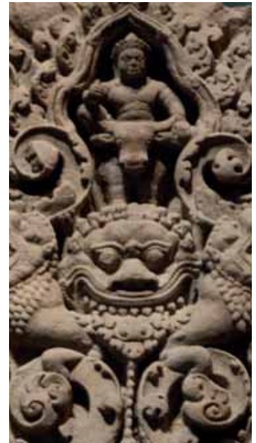
Lintel with Yama, Cambodia, Bataey Srei style, 12th-13th century, Sandstone, 23.5 x 153.5cm