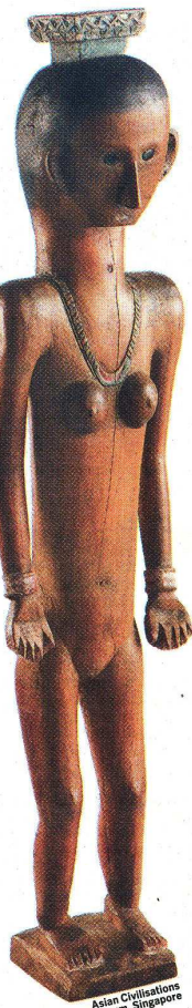
Above, an ancestor figure from Flores Island (now part of Indonesia), is in a Singapore exhibition. A pre-Columbian gold male figure, right, is in a Budapest display of Inca artwork.

GERMANY | BERLIN NEUE NATIONALGALERIE To Oct. 7: "Französische Meisterwerke des 19. Jahrhunderts aus der Sammlung des Metropolitan Museum of Art New York." About 135 works from the Met's collection of French 19th-century paintings, ranging from society portraits by Ingres to works by Manet, Courbet and Renoir, and ending with paintings by