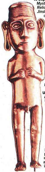
Museo de América, Madrid

HONG KONG HONG KONG HERITAGE MUSEUM To Sept. 9: "Splendour and Mystery of Ancient Shu: Cultural Relics From Sanxingdui and Jinsha." In 1986, the discovery of two sacrificial pits in Sanxingdui, Sichuan Province revealed a trove of jade, gold, bronze and stone artifacts. Similar relics and ivory items were unearthed in 2001, at a burial site in Jinsha, 50 kilometers away: The Shu Kingdom was unveiling some of its 3,000-year-old mysteries. On display are bronze heads and masks, gold ornaments, jade items and pottery excavated at the two sites. http://hkheritage.museum